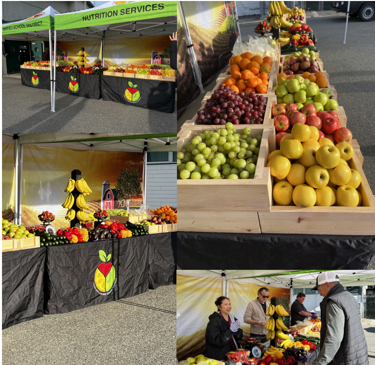
Farmer's Market at Lincoln Elementary School, April 2026